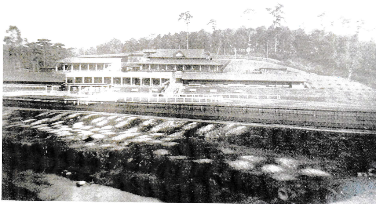
Old picture of SRGT's Shillong Gymkhana Turf Club