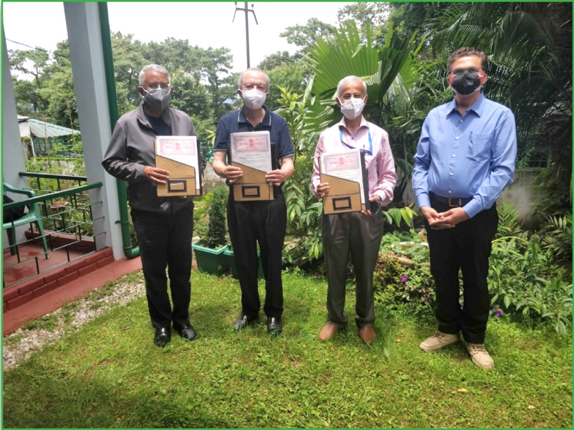
Signing of Agreement between SRGT and Powergrid for E.V. Charging Point - 2022