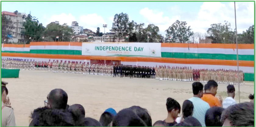
Independence Day Celebration, 2022 at SRGT 2 nd Ground