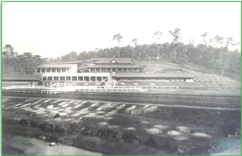
Old picture of SRGT's Shillong Gymkhana Turf Club