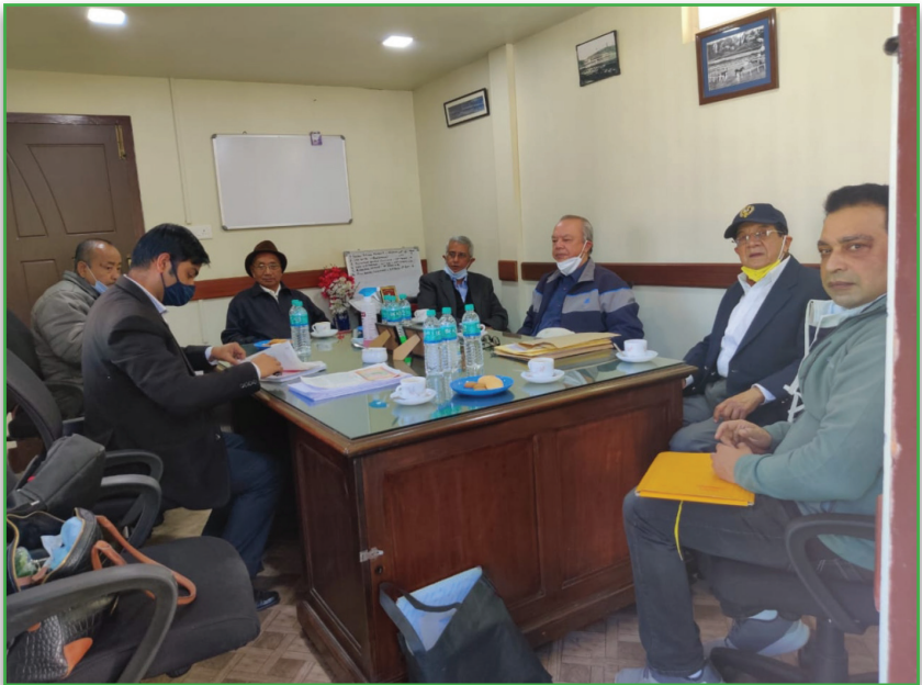
Signing of the Lease Agreement with Mission Trust for the Eye Hospital - 2020