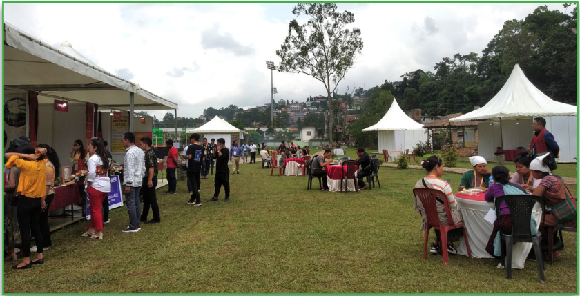
Food Festival, 2022 at SRGT Park