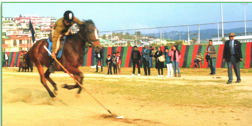
Tent pegging at Horse Show & Regional Equestrian League, 2018 at SRGT 2 nd Ground