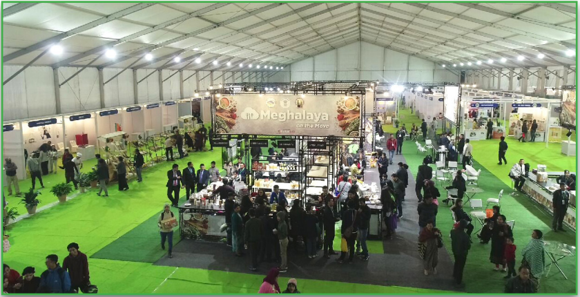
International Food Festival, 2019 at SRGT 2 nd Ground