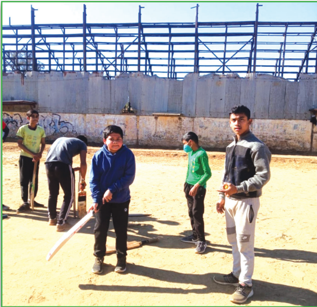
Local Lads playing at SRGT 2 nd Ground - 2023