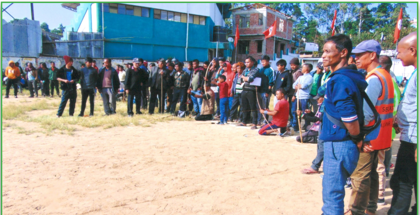
Rongbiria organised by Seng Khasi Kmie at SRGT 2 nd Ground - 2022