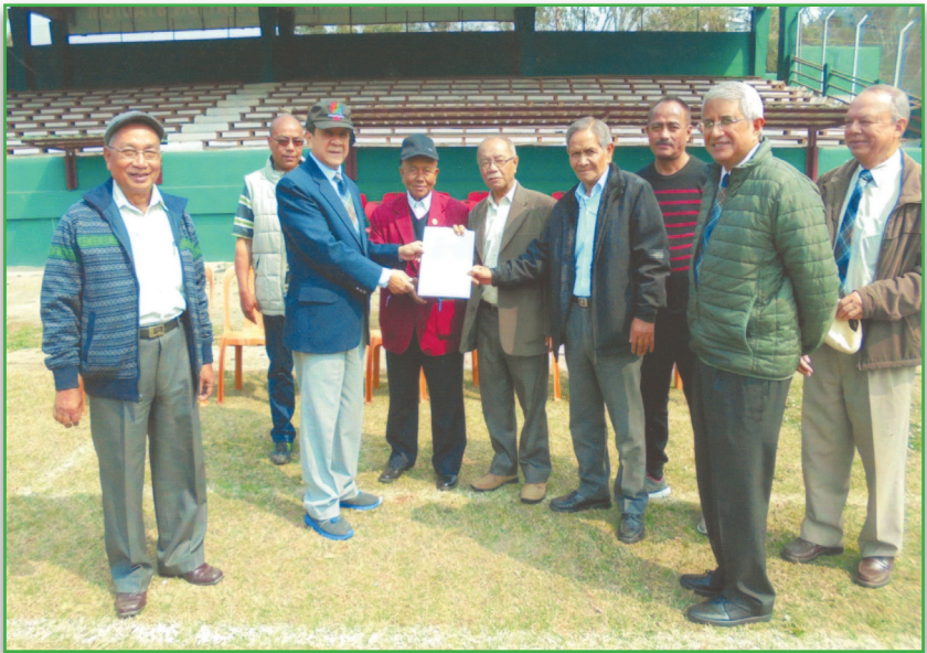
Signing of Lease Agreement between SRGT and Shillong Sports Association (SSA) - 2017