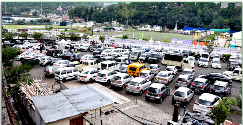
Parked Vehicles at SRGT Parking Lot during North East Food Show-2022