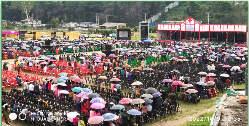
Church Service, 2023 at SRGT 2 nd Ground